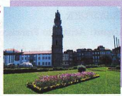
Torre dos Clérigos

The history of this town began in the V century during Roman times and the city developed its importance as a commercial port, taking the name Portus Cale. Before Arabian occupation , Portugal became an independent Kingdom and in the 14th and the 15th centuries , the shipyards of Porto contributed to the development of the Portuguese fleet. On 1754 an Italian architect, Nicola Nasoni made a project of a tower that became the icon of the town (Torre dos Clérigos). During XVIII and XIX century , Porto became a very important industrial center and increased its dimension and population.