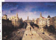
Avenida dos Aliados