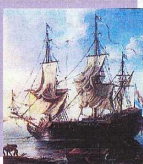
Ancient portuguese war ship